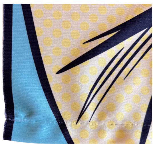
Dye Sublimation/ Printed Fabric

1" Hemmed Edge | 6" Pocket (Top and Bottom)